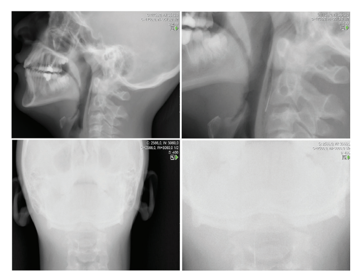
Figure 1. Radiological image

complication that may occur during any dental procedure (3). In the literature, several cases of various dentistry tools that were accidentally swallowed were reported. In a study, the incidence of accidental endodontic ingestion was found to be 0.12 in the 100.000 root canal treatment (2). Therefore, use of rubber dams during all intraoral dental procedures is recommended (3,6,8). In our case, it is interesting that the patient was asymptomatic for so long, and that he thought he swallowed something while eating a hamburger and also the dentist did not recognize the absence of a large dental file used during a root canal treatment. The very first step in managing such cases is accurate determination of the foreign body lodgment site. This can be done through plain radiographs, computerized tomography, or magnetic resonance imaging. Upper and lower gastro-intestinal endoscopy and bronchoscopy can be used diagnostically as well as therapeutically.