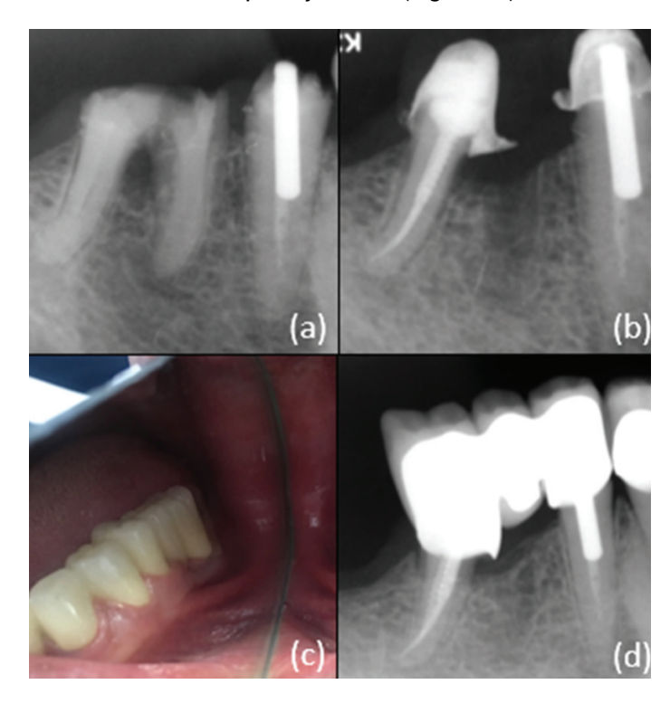
Figure 1. Case 1 (a) Diagnostic radiography of tooth 46 (b) Post-treatment radiography of tooth 46 (c) Metal supported fixed denture applied to tooth 46 (d) Figure 1d. 18 months follow-up radiograph of tooth 46

After 18 months follow-up; it was observed that the tooth was clinically asymptomatic and that the extraction cavity of the root was completely healed (Figure 1d).