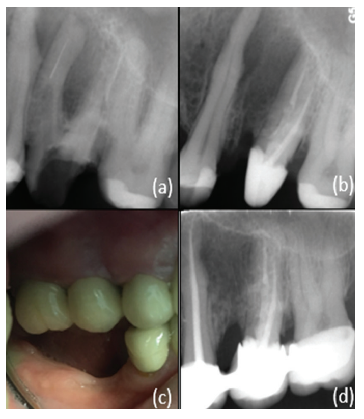
Figure 2. Case 2 (a) Diagnostic radiography of tooth 26 (b) Post-treatment radiography of tooth 26 (c) Metal supported fixed denture applied to tooth 26 (d) 12 months follow-up radiograph of tooth 26

After 12 months follow-up; it was observed that the tooth was clinically asymptomatic and that the extraction cavity of the root was completely healed (Figure 2d).