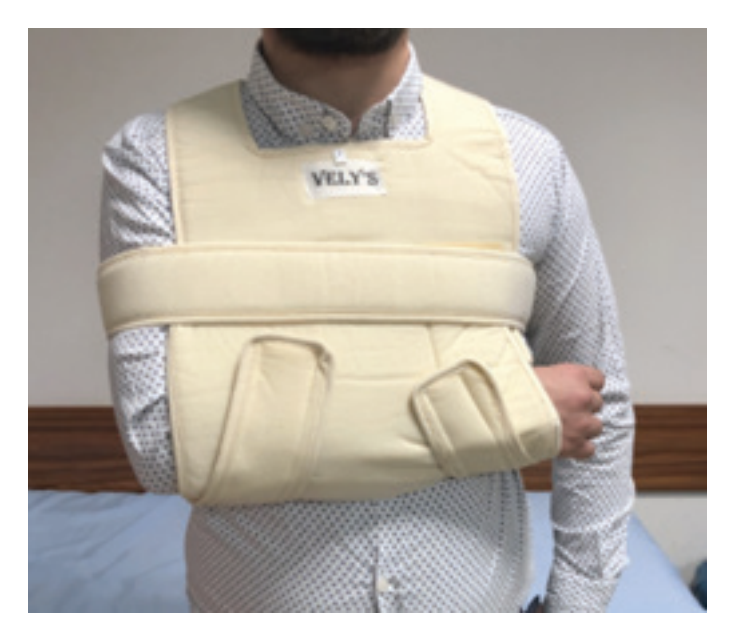
Figure 1. Velpeau bandage

Velpeau bandage was applied to the patients who were treated conservatively (Figure 1). Immobilization, ice and anti-inflammatory drugs were used to reduce pain and inflammation. In order to prevent edema in the distal part of the extremity; Hand-wrist joint range of motion (ROM) exercises were started and elbow ROM exercises were started in the first week. At the end of the first week, the arm sling was intermittently removed and the limb was supported with a pillow under the arm while the patient in sitting position. Also, pendulum exercises were added to wrist and elbow exercises this week.