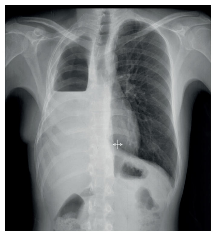
Figure 4. PA lung image of the patient in the first postoperative year