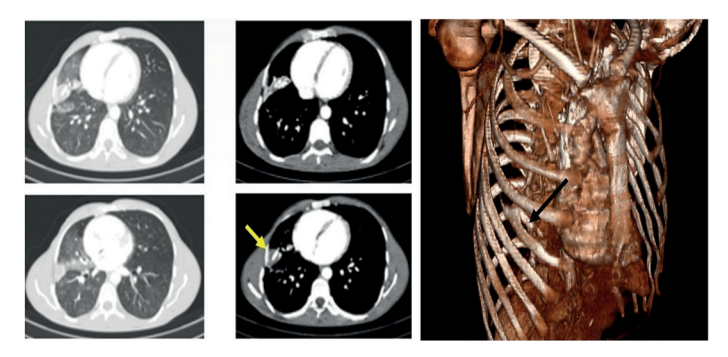
Figure 2. Consolidated lung area in the middle-lower zone of the right lung, in which bone density is monitored and with a ground glass appearance around it(yellow arrow). Fracture in right 4, 5, 6th ribs and laceration with rib part in the parenchyma (black arrow)

Computed tomography of thorax (Thorax CT) reported as "Widespread alveolar filling is observed in ground glass density around the common consolidated lung area in which the bone density is monitored in the middle-lower zone of the right lung (Contusion?). The right 5th rib is defective in the lateral section and extends towards the lung parenchyma". Rib fracture and laceration in the parenchyma were seen in three-dimensional imaging (Figure 2).Because the fracture line had a callus and no history, it was thought that the fracture was not acute.