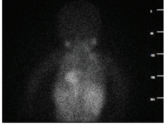
Figure 3. Scintigraphy did not show marked MIBG uptake in the liver

adrenal glands (Figure 3). Distant bone metastasis was not also identified. Findings were assessed as congenital NBL with primary mass not identified linked to regression and diffuse infiltrative liver and paraaortic lymph node metastasis. Accepted as stage 4S, the patient was monitored without treatment. Abdominal ultrasound and MRI 2 months later observed the liver was normal with homogeneous appearance.