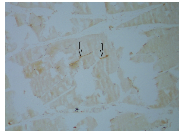
Figure 3. Linear appearance on cytoplasmic membrane with Claudin-5, 2 positive staining (Claudin-5 X 200)