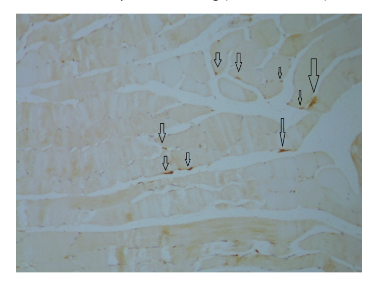
Figure 4 . Linear appearance on cytoplasmic membrane with Claudin-5, 3 positive staining (Claudin-5 X 200)