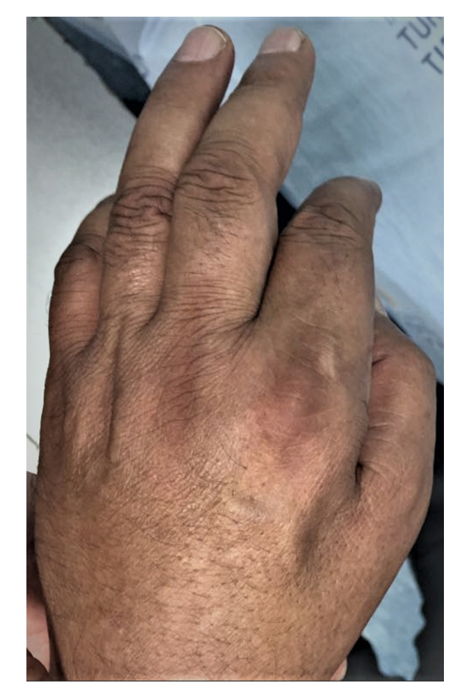
Figure 2. Left hand distal and proximal atrophy and joint contracture