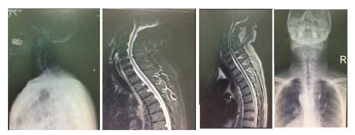
Figure 3. MRI image of hinging cervical involvement

The distance of anterior head tilt was 18.5 mm, the C7 corpus vertebral angle (C7 angle) was 37°, the posterior tangent method was C2-3 C7 with 21°-34° cervical lordosis while patients diagnosed with Hirayama disease usually have a 43.7° angle of cervical lordosis. (Figure 3).