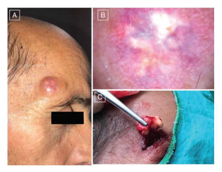
Figure 4. A) A dome shaped nodular lesion on the temporofrontal region. B) Dermoscopy of the lesion shows polychromatic structures also known as rainbow patter C) Intraoperative appearance of the lesion

Polychromatic structures also known as "rainbow pattern" in metaphorical language is described as the presence of several different colors juxtaposed next to each other (9). The histological counterpart of this finding is thought to be a vascular lumen-rich pattern of closely arranged 'back-to-back' vessels (10). Rainbow pattern first described as a specific phenomenon to Kaposi's sarcoma but it has subsequently been shown in many conditions like blue nevus, angiokeratoma, hypertrophic scars, stasis dermatitis and pyogenic granuloma (9,11,12). However, to our knowledge, there is no another study reporting this pattern previously for EC. In the present study we identified this finding in a face localized lesion (Figure 4).