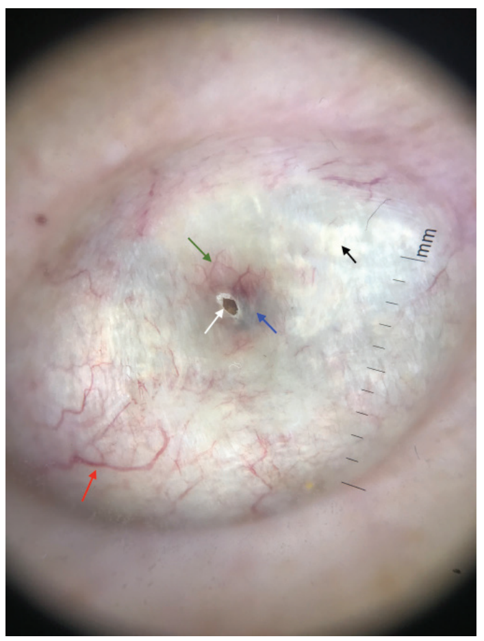
Figure 3. White structureless background (black arrow), bluewhite weil (blue arrow), punctum/pore sign (white arrow), widespread branched irregular linear vessels (green arrow), peripheral thick branched vessels (red arrow)

When it comes to the dermoscopic vascular finding, Suh et al, described two pattern as peripheral linear branched vessels and arborising telangiectasia. They reported that these two patterns were observed in 42% and 11% of the lesions respectively (3). We observed two different vessel patterns similarly: widely distributed/branched irregular linear vessels (Figure 1,2,3) and peripheral thick branched vessels ("arborizing vessels") (Figure 1,3) which were observed in 71% and 33% of the lesions respectively. These vascular findings are considered to be associated with congestion of the blood as a result of the pressing caused by mass effect of the cyst.