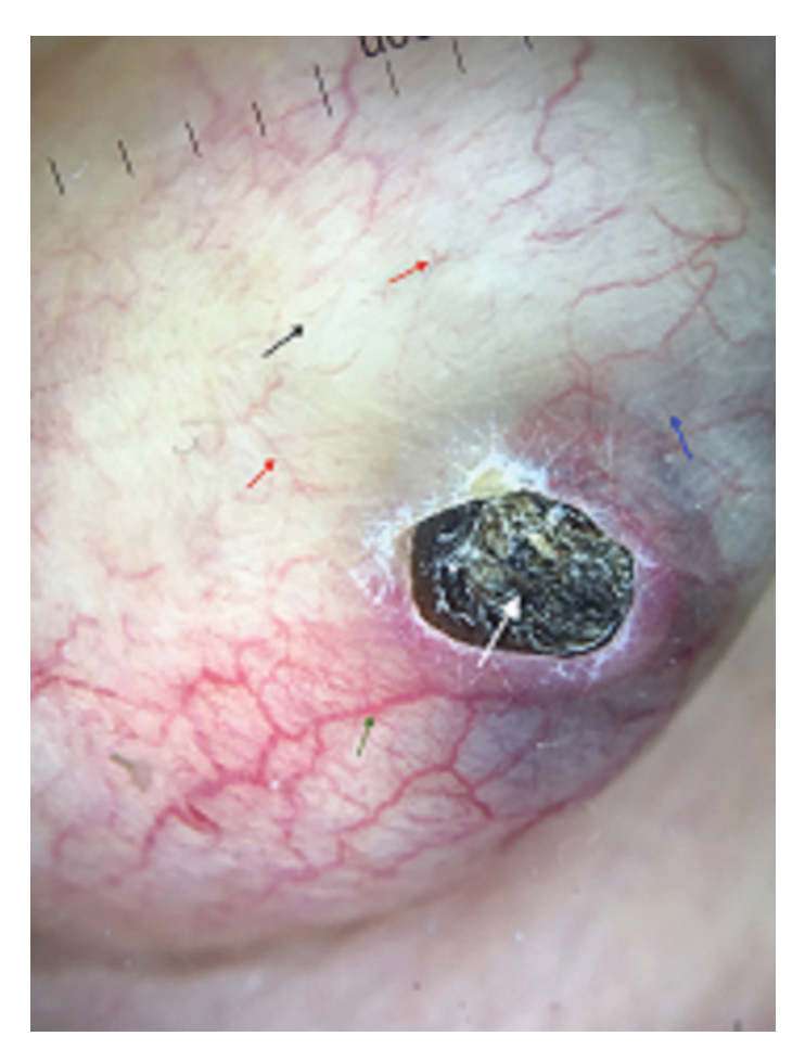
Figure 1. White structureless background (black arrow), blue-white weil (blue arrow), punctum/pore sign (white arrow), widespread branched irregular linear vessels (red arrows), peripheral thick branched vessels (green arrow)