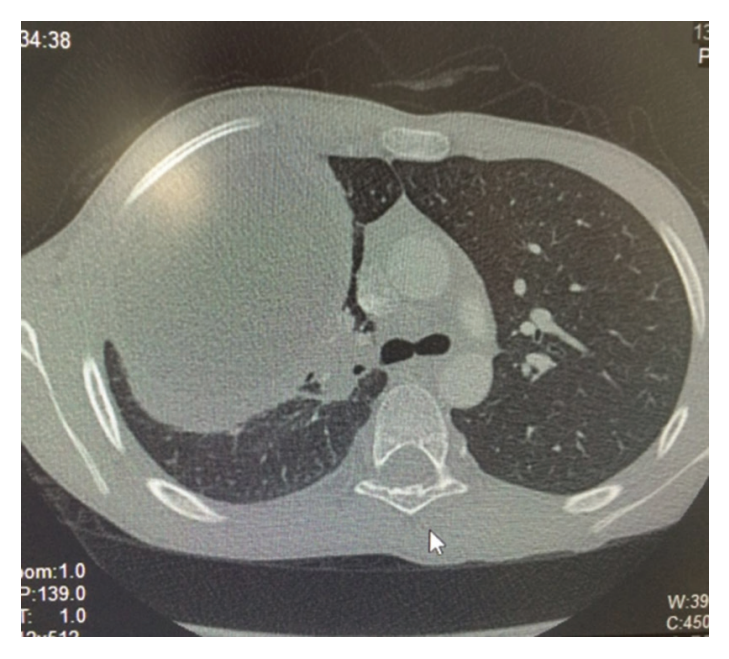
Figure 2. Chest Tomography

Because of immature immunity and increased lung elasticity, larger cysts may be seen in children when compared to adults (3,4). Pulmonary hydatid cyst involves the right lobein 60% of cases, and liver cysts are seen in 20% of cases. A secondary bacterial infection, pneumonia or empyema may accompany to or develop after hydatid cyst. The cyst also can rupture and lead to pneumothorax, pleural effusion, chest pain, hemoptysis, vomiting and spasmodic cough (5,6)