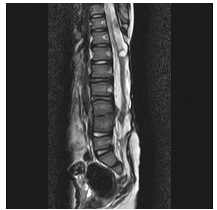
Figure 1. T2 sagittal image of split cord malformation

or myelomeningocele was in 30.8%, syringomyelia in 26.9% of the cases. Remaining 15.4% of patients (3 cases) had dermoid tumor, sacrum and coccygeal agenesis, Tarlov's cyst and hemivertebrae. (Figures 2, 3).