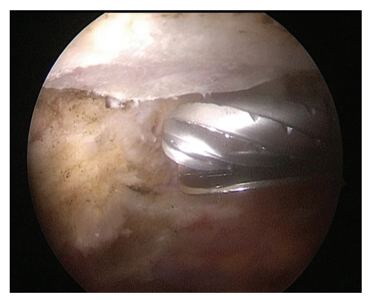
Figure 2. Arthroscopic view of acromioplasty.