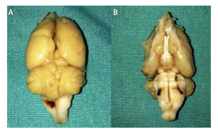
Figure 1. Blood clots in the subarachnoid space (A) Ventral surface of the rat brain. (B) Dorsal surface of the rat brain