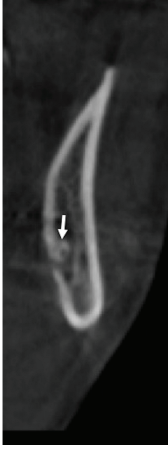
Figure 3. Type B relationship: root apex is located at cortical plate, but not penetrated into the soft tissues (arrow)