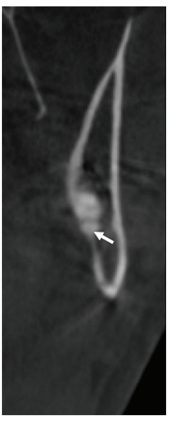
Figure 4. Type C relationship: penetrated root apex to the lingual into the soft tissues (arrow)