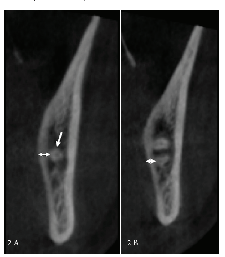
Figure 2. Type A relationship. A, the distance between the root apex of the tooth to the lingual soft tissues (double arrowhead) and arrow showing root apex. B, the distance from the most lingual point on the apical half of the root to the sublingual soft tissues (double arrowhead)