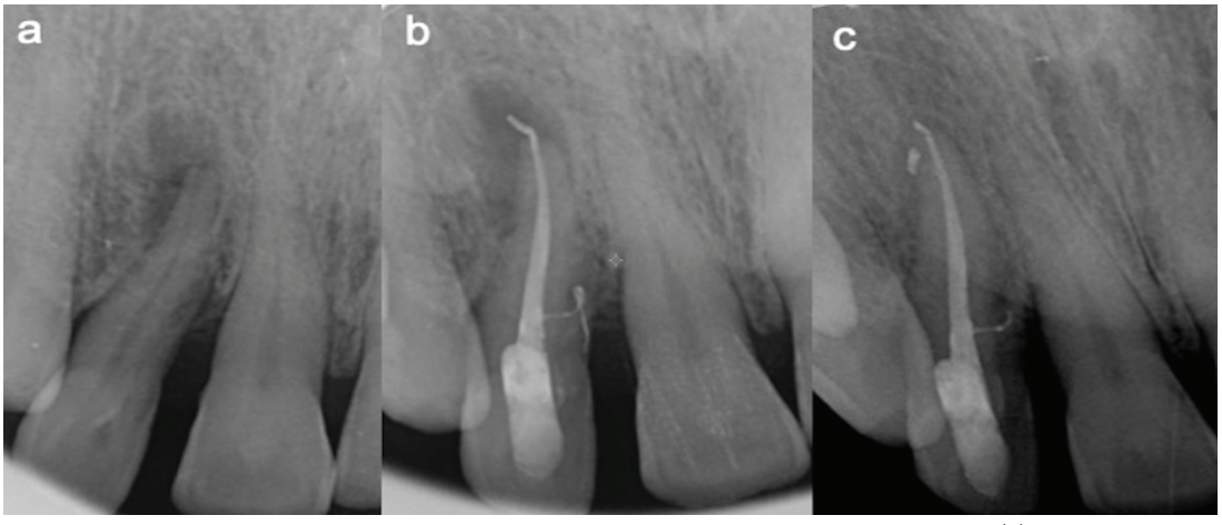
Figure 3. Preoperative periapical radiograph of maxillary right lateral incisor (a). Postoperative radiograph showing sealer penetration to lateral canal thanks to copious irrigation (b). 24 months follow-up radiograph showing healing of the lesion and partially resorbed and migrated sealer (c).

Lesions of 6–10 mm diameter (50teeth) healed in 47 (87.5%) cases consisting of 43 (79.2%) (28 mandibular, 15 maxillary) complete healing and 4 (3 mandibular, 1 maxillary) incomplete healing (Table 1). Lesions with a diameter ranging from 11 to 20 mm (39 teeth) healed in 34 (77.8%) cases including 31 (66.7%) (19 mandibular, 12 maxillary) of complete healing and 3 (11.1%) (2 mandibular, 1 maxillary) of incomplete healing (Table 1). There was no positive correlation between the outcome of the therapy and the size of the periapical lesions (p>0.05).