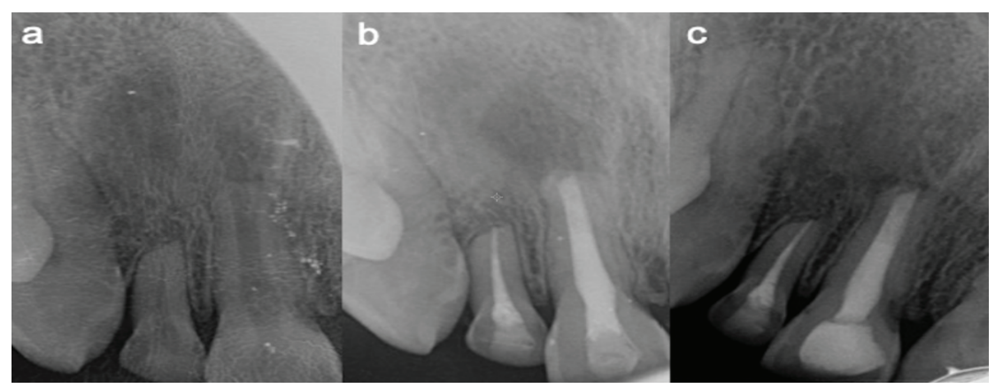
Figure 1. Preoperative periapical radiograph of maxillary right central and lateral incisors showing external root resorption with large periapical lesion in central incisor due to trauma (a). Postoperative radiograph demonstrating apical plug using MTA in central incisor (b). 24 months follow-up radiograph showing periapical healing (c).