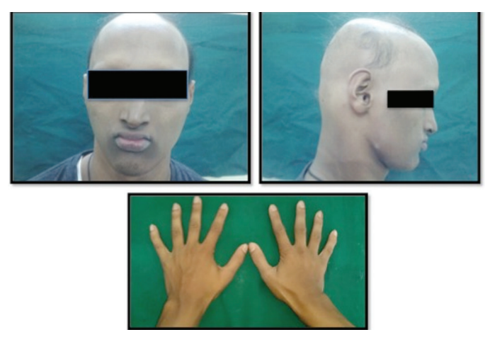
Figure 1. Extra Oral Photo Showing Scanty Hair, Absent Eyebrows, Protuberant Lips and Unaffected Hands and Nails