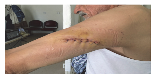
Figure 3. Post op photo of the patient