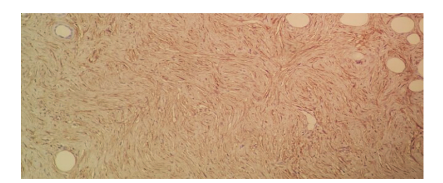
Figure 2. CD 34 dyed at x40 magnification