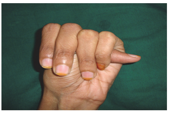
Figure 4. Clinical photograph of the patient showing Steinberg's sign.