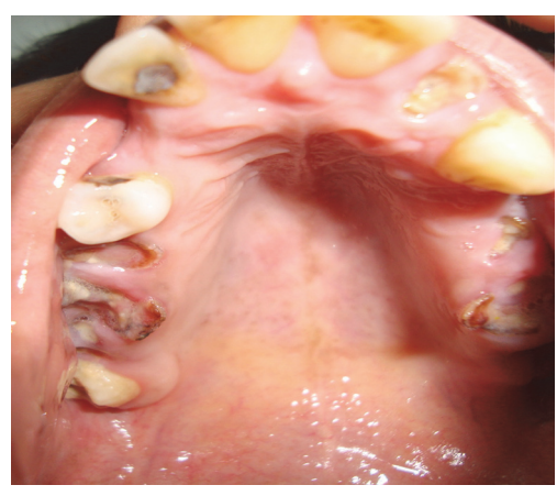
Figure 5. Clinical photograph of the patient showing high arched palate.