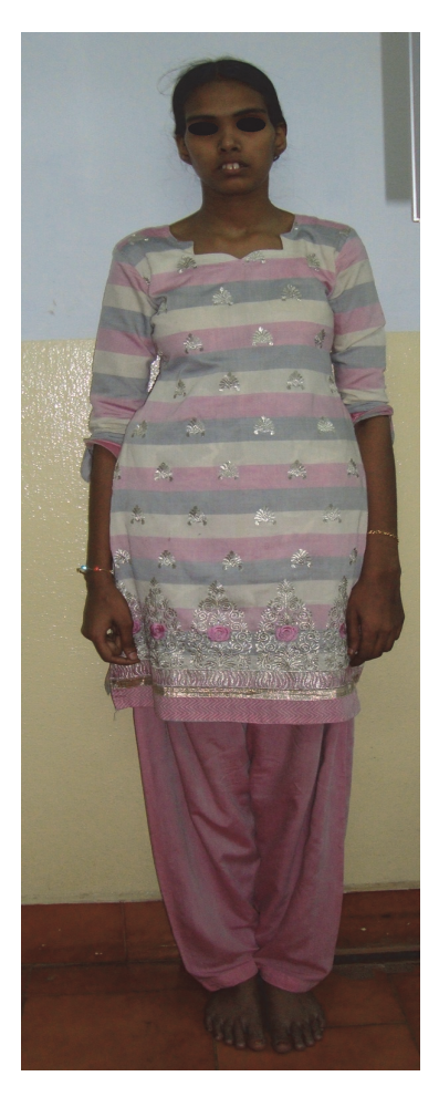
Figure1. Clinical photograph of the patient showing tall stature with thin body habitus.