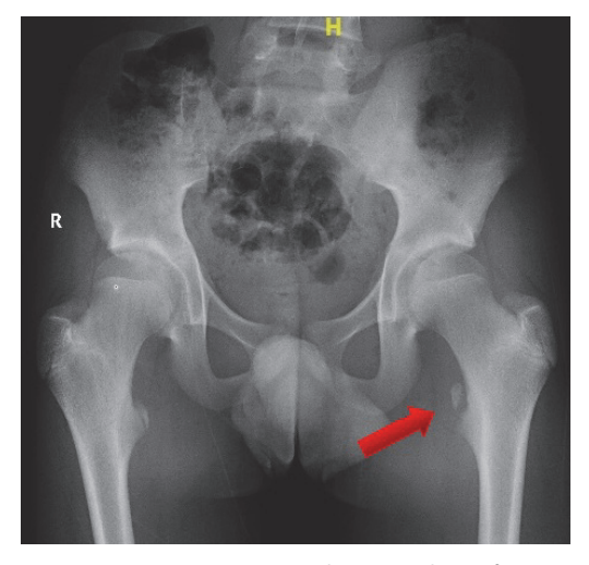
Figure 1. X-Ray Imaging, shows avulsion fracture of left trochanter minor.

13-year-old patient presented to orthopedic and traumatology department due to a sudden pain in the left hip occurring during a ball shot while playing football on a field 4 days ago. On physical examination his passive and active hip motions were both painful, and there was extreme pain on his trochanter minor during palpation. Neuromotoric and vascular system examinations were normal. Radiological examinations showed avulsion fracture of the trochanter minor (Figure 1). Magnetic Resonans Imaging (MRI) was taken to identify if there was an additional pathology but we couldn't observe any additional pathology except avulsion fracture (Figure 2). Because of the pediatric age of patient we didn't consider to take computed tomography (CT) to prevent radiation exposure. We started analgesic and anti-inflammatory drug treatment, cold application and bed rest with lying position while hip was in 30 degree flexion in the acute stage. Patients were mobilized after 2 weeks with elbow crutches. Four weeks later, we started active hip motions and allowed walking with weight bearing. At the end of the 6 weeks the patient was allowed to start athletic activity. The patient did not have any problem about his left hip in his daily life.