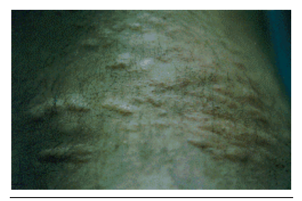
Figure 2. Shagreen patches on lumbosacral region

Tuberous sclerosis complex is a hamartomatosis characterized by the widespread development of benign tumors classified as hamartoma and affecting up to one in 6000 to 10000 newborn infants. It is an autosomal dominant syndrome with prominent cutaneous and brain involvement and is often associated with seizures and mental retardation. The disease can also result from spontaneous mutations. Approximately 60% of tuberous sclerosis occurs as apparent sporadic cases (1,4-6).