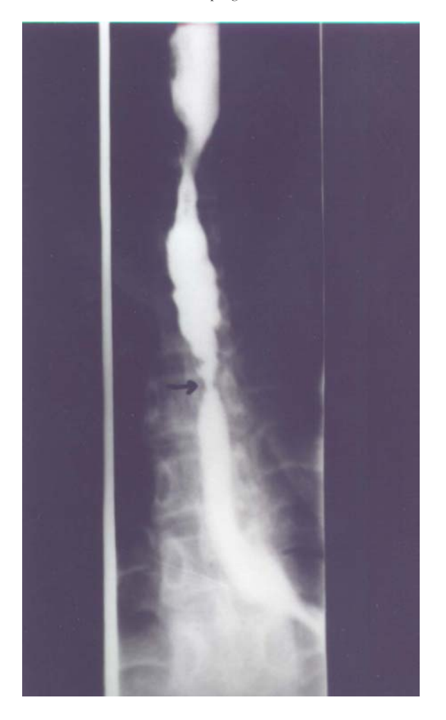
Figure 2. Barium study of the esophagus demonstrating stricture at the 25th and 30th cm of the esophagus.

Our patient had drunk on alkaline fluid the Fehling's solution. Defining the stricture and excessive esophageal ulcers in spite of admittance after 27 days of exposition to caustic material shows how serious effects alkaline solutions can lead to. Although alkaline solutions cause injury mostly in esophagus because of its neutralization with gastric acid, development of pyloric stenosis in the patient reveals the gastric influences as well.