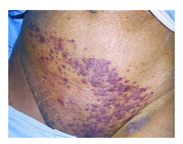
Figure 1. Maculopapullary skin eruptions on bilateral legs and abdomen.

Punch biopsy and fine needle aspiration of skin lesions revealed infiltration of lymhoma cells (Figures 2 and 3). He developed anemia, thrombocytopenia, bone marrow involvement and increased lactate dehydrogenase levels (5935 IU/L). He deceased after the initation of cytarabine treatment. The presumed causes of death were gastrointestinal system bleeding and pulmonary infection. The time interval from diagnosis to death was approximately nine months.