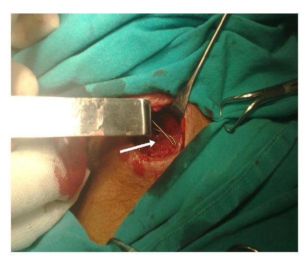
Figure 2. Presence of the knot formation between the platysma fibers (arrow). A simple retraction from this point served to liberate the entrapped guide.