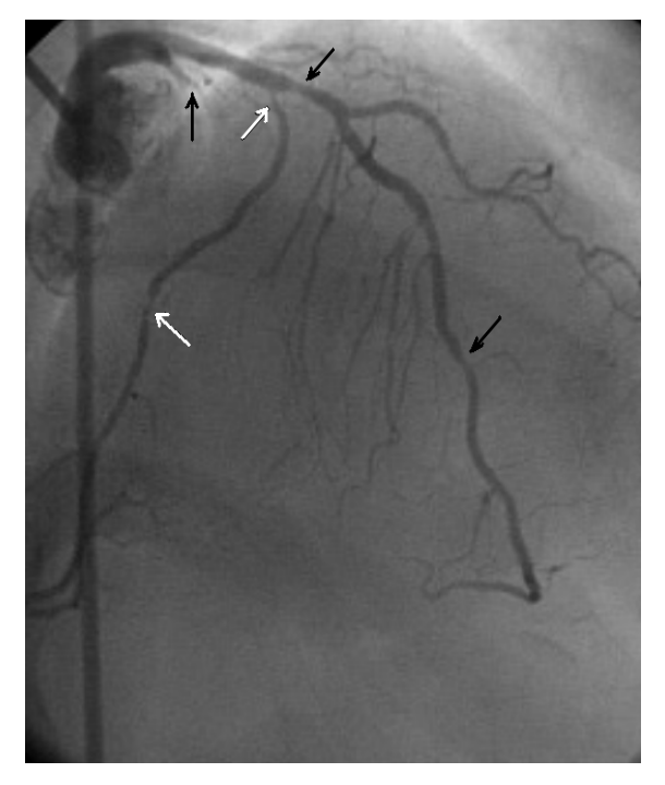
Figure 3. Right anterior oblique-cranial view of coronary angiography demonstrates atherosclerotic lesions in the LAD and Cx ( dark arrows ). Note that there is also atherosclerotic process in the anomalous right coronary artery ( white arrows .)