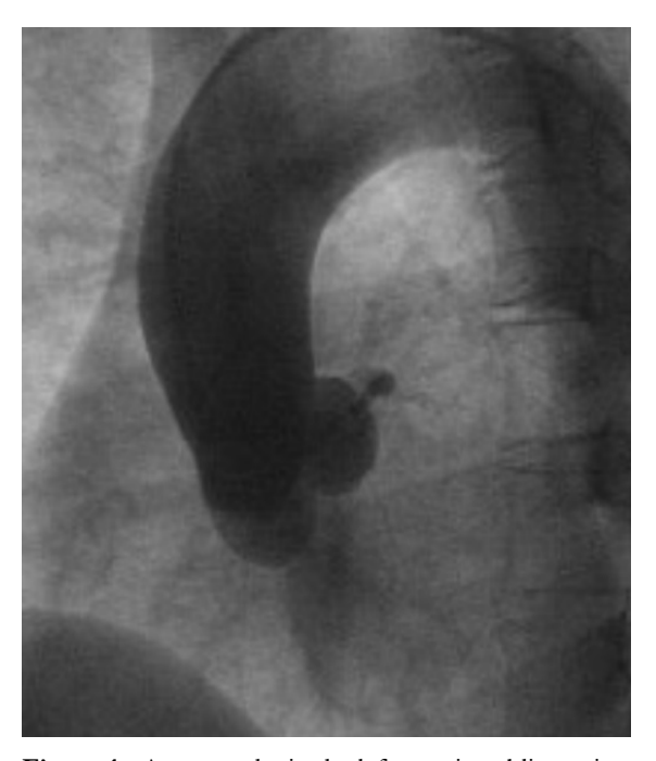
Figure 1. Aortography in the left anterior oblique view demonstrating absence of right coronary ostium in the right sinus of Valsalva