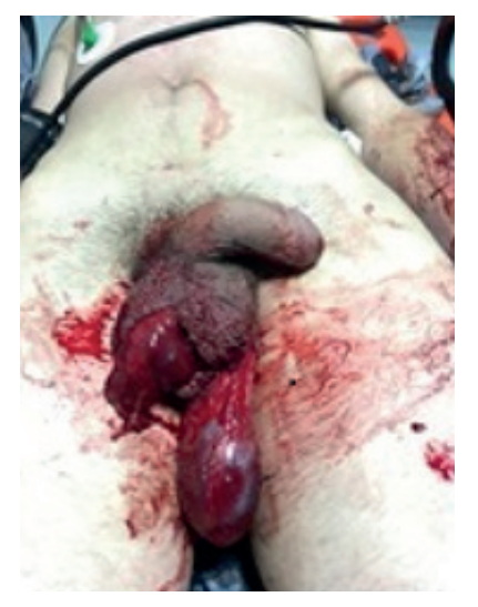
Figure 1. The ruptured right testis

left mid diaphysis segments of the patient. In the pelvis CT of the patient, displaced fracture lines were observed on the right side of the sacrum and in bilateral pubis inferior segments. The patient was underwent emergency surgery for intraabdominal hemorrhage and liver laceration by general surgery. The patient was taken to surgery within 3 hours after being brought to the emergency room. Also urology joined the operation. Urology carried out right orchiectomy and left testicular fixation on the patient.