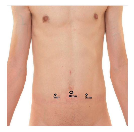
Figure 1. Trocars placement in one side hernia

Ultrasonography was routinely performed in the bilateral inguinal region to detect cryptorchidism, spermatic cord hydrocele and tumours with the help of radiology unit of our hospital. All patients underwent surgery were taken into operation after signing the consent form.