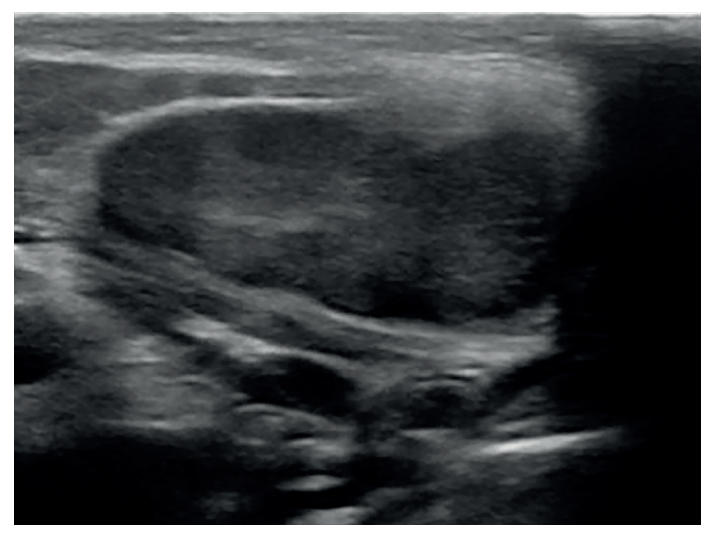
Figure 2. Ultrasound image showing mesenteric lymphadenopathy in the right lower quadrant of the abdomen