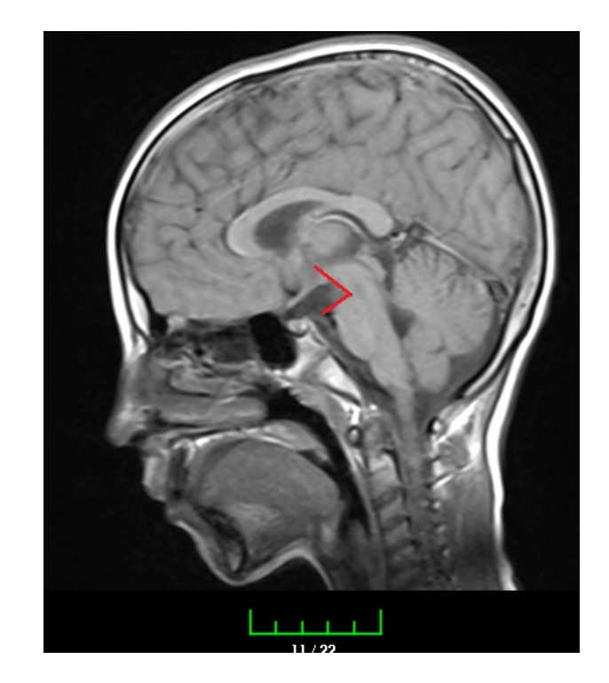
Figure 1. Shows pontomesencephalic angle (PMA) measurement

The variance homogeneity test indicated that the variance of PMA values was different in various subgroups (F(4,201)=2,598; p<0,05). Therefore, Tamhane test (post-hoc) was used to compare PMA values. A p<0.05 was considered as statistically significant.