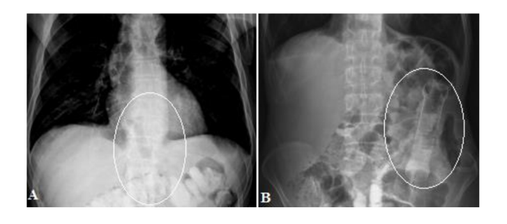
Figure 3. A) Self-expanding metal stents (SEMS) migration in esophagojejunostomy anastomosis B) SEMS migration to the small intestines.