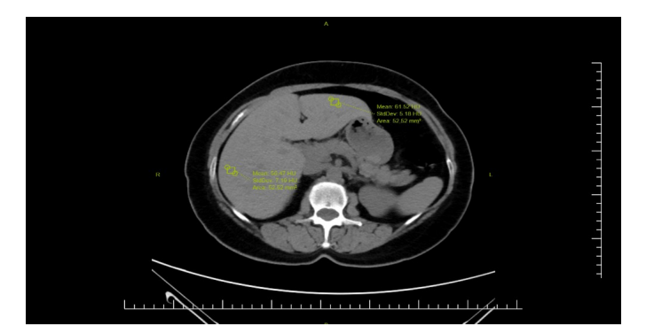
Figure 1. Measurement of liver density in a PCR (-) patient