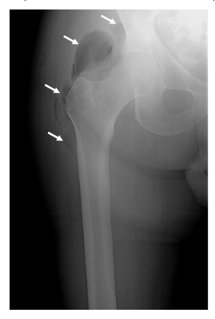
Figure 1. The anteroposterior radiograph of the right hip demonstrates extensive air lucencies (arrows) within the deep soft tissues around the hip.

tent with air-fluid density and tending to merge. There were diffuse oedematous-inflammatory signal abnormalities in the soft tissue (Figure 2). The first session treatment involved abscess drainage and radical debridement of necrotic tissues. On the fifth postoperative day, malodorous discharge was observed in the incision. A general surgery consultation concluded that his abdominal examination was normal and a colonoscopy for advanced examination disclosed a fistula originated laterally from the proximal part of the anastomotic line and this fistula drained into a pouch of approximately 10 cm at the Blinded Manuscript Click here to view linked distal end of the rectum. An abdominal computed tomography was performed when the patient's symptoms recurred to determine where the secondary infection was located. Anastomotic leakage was detected proximal to the rectal stapler line and diffuse abscess foci, which were located in the muscle groups around both hips and proximal right thigh, containing air-liquid densities similar in appearance to the colon contents, with a contrasted thick wall structure, associated with each other and the rectal lumen (Figure 3). General surgery resected the fistulizing segment and applied an ostomy. Radical debridement was again