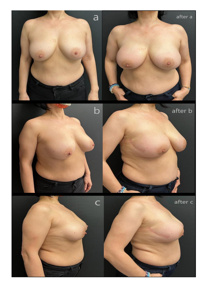
Figure 1. 47-year-old multiparous patient with grade 2 pitosis. Dual plane bilateral reconstruction with bovine pericardium-derived mesh was performed in the patient with right breast cancer. Preoperative anterior (a), oblique (b), lateral (c) view. Postoperative 12th month anterior (a), oblique (b), lateral (c) view.

The mean age of the patients was 43.7 years (ranged from 34 to 62 years). Unilateral reconstruction was performed in 55 patients and bilateral reconstruction was performed in 68 patients. The highest number of patients had grade