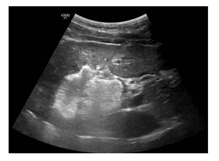
Figure 3. Injection of hypertonic saline.