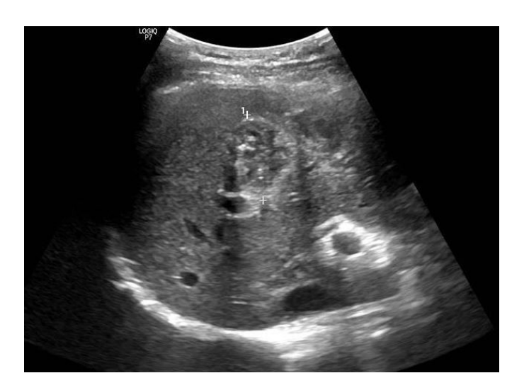
Figure 4. Cystic inactivation and pseudotumor appearance.

aspiration and PAIR was terminated (Figure 1, 2, 3) [14].