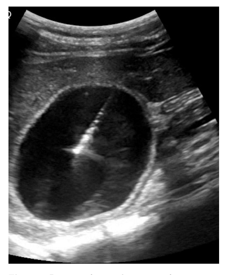
Figure 1. Puncture of cyst and aspiration of cyst content.

PAIR: Under sonographic guidance, an 18G Seldinger needle was used to puncture the cysts. About 20% of the cyst's estimated volume was aspirated. Under fluoroscopy, a contrast agent was injected via needle to detect any possible peritoneal or biliary connection. If cystography revealed there was no communication with the biliary tree,