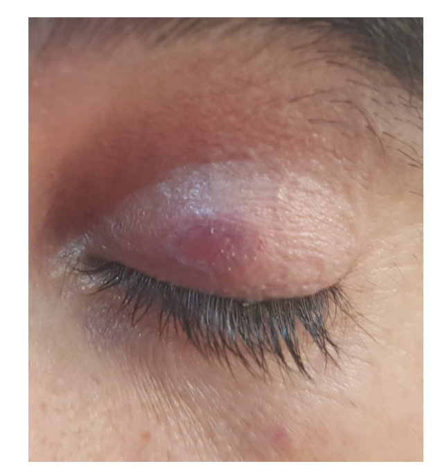
Figure 1. A lilac erythematous annular plaque on the left upper eyelid

A 38-year-old male patient presented to our outpatient clinic with a complaint of redness on the left upper eyelid. The redness persisted for 3 months and a similar lesion appeared and disappeared 1 year ago on his penis. On dermatological examination, an annular, violaceous erythematous scaly plaque 1 cm in diameter on the left upper eyelid was observed (Figure 1). The orogenital mucosal surfaces and the nails showed no involvement. Dermoscopic examination revealed a central bright red structureless area surrounded by a keratin scale and reddish structureless area (Figure 2).