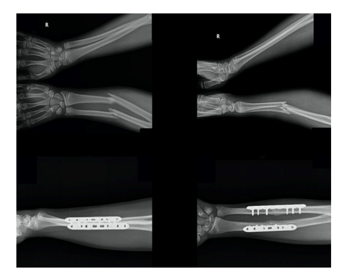
Figure 4. Group C, Fourteen-year-old male patient

Patients were divided into three groups in relation with the fixation method. Group A consisted of the ones with ESIN fixation of both radius and ulna (Figure 1). The patients who had ESIN fixation of one forearm bone, and plate fixation of other forearm bone were called as Group B (Figures 2,3). Group C consisted of the adolescents in whom both bones were fixed with plate fixation (Figure 4).