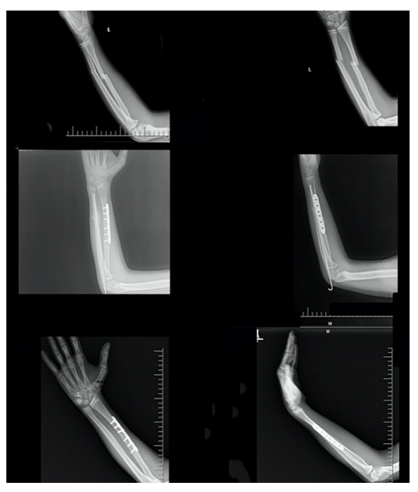
Figure 2. Group B-1, Twelve-year-old male patient

approved by local Ethics Committee of our hospital. Adolescents between 10-16 years of age were included in the study. Indications for surgery were instable fractures that could not be reduced conservatively, or inability to maintain conservative reduction in those fractures. Open fractures, single bone fractures, and Monteggia and Galeazzi fractures were excluded. The fractures were classified in relation with AO/OTA classification (23).