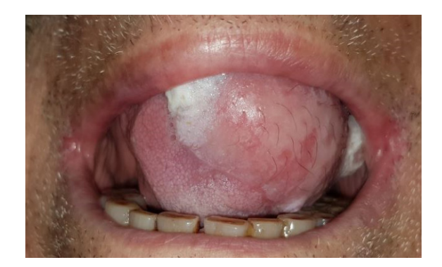
Figure 6. Late post-operative view 2