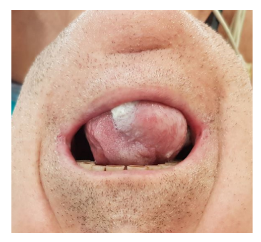
Figure 5. Late post-operative view