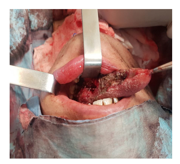
Figure 1. After tumor resection of tongue

Soft tissue defects were repaired with free radial forearm flaps (Table 1). All of the flaps were planned as fasciocutaneous. 4 of these repairs were on the tongue, (Figure 1, 4, 5 and 6) 4 on the nose wings, 4 on the ear, 4 on the lower lip, 4 on the malar region, 2 on the palate, 1 on the upper lip and 1 on the neck. All of the flaps were planned as fasciocutaneous and harvested (Figure 2 and 3). While 17 of the tissue defects occurred after tumor excision, 6 of them were caused by trauma, 1 of the tissue defects was due to a gunshot wound. The average pedicle length was 9.6 cm.