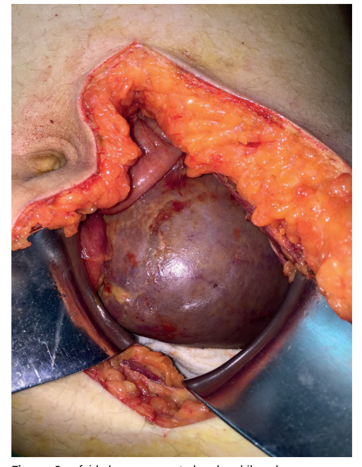
Figures 2. a fairly large, congested and mobile spleen was seen in the pelvis

The patient was admitted to the general surgery ward. The abdomen was entered with a midline incision above and below the umbilicus, while under general anesthesia and in the supine position. During exploration a fairly large, congested and mobile spleen was seen in the pelvis (Figures 2, 3). There was a freely floating splenic structure with no gastrosplenic, splenorenal, splenocholic, and frenosplenic ligaments. The vascular pedicle was quite long and rotated around itself. Splenectomy was concluded with the binding of vascular structures.