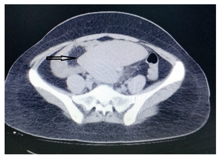
Figure 1 . The spleen was located in the pelvis. A non-homogenous area of the spleen parenchyma indicated an infarctus

Doppler USG showed impaired vascularity, and Computerized Tomography (CT) examination was conducted. The spleen was located in the pelvis. A non-homogenous area of the spleen parenchyma indicated an infarctus (Figure 1). As a result of physical examination and radiological examinations, the patient was decided to be operated on with a provisional diagnosis of torsion of the spleen.