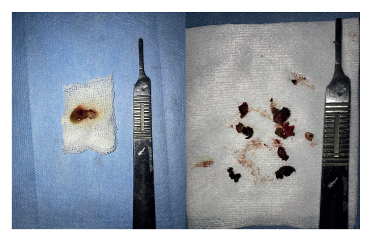
Figure 3. Surgically excised pathological tissue