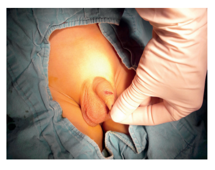
Figure 2a. Superficial penile dermal wound due to zipper injury after 2 weeks