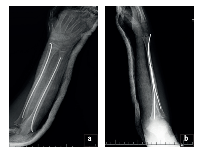
Figure 2 . (2a-2b) a 10-year-old male was operated with closed reduction and elastic nail method

In the elastic nail surgery technique, after closed reduction was performed in the distal radius or proximal ulna, elastic nails were sent antegrade or retrograde. The ends of elastic nails were left under the skin and the wounds were sutured. If closed reduction was not achieved, open reduction was performed. Nails with a diameter of 1.5 mm to 2.5 mm were used depending on the age of the patients and the bone medulla thickness (Figure 2a-2b).